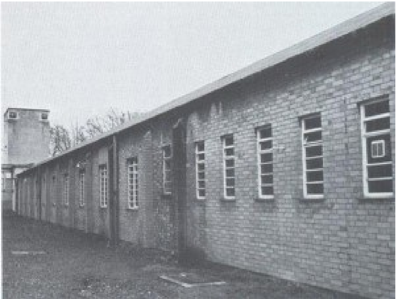
Latimer interrogation block (at the top of the King's Walk) (PHO3644)

Latimer House held many of Hitler's German Generals for a few days before they were transferred to more permanent wartime accommodation at the stately house of Trent Park , Cockfosters in North London. British Intelligence realised that it was more productive to 'befriend' the Generals than try to extract information by threats.